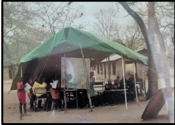
School room today