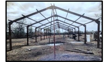
Plans for a larger future