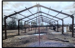
Plans for a larger future